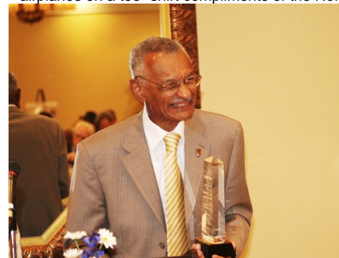
Dr. C.T. Vivian smiles as he accepts an award for being the Keynote Speaker at the 2 nd Annual ACCORD/Northrop Grumman Freedom Trail Luncheon at the Casa Monica Hotel. July 2, 2008